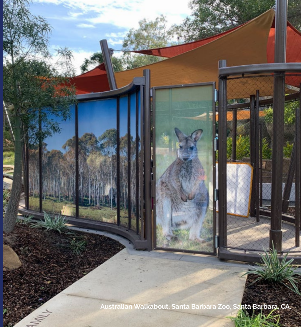
Australian Walkabout, Santa Barbara Zoo, Santa Barbara, CA.