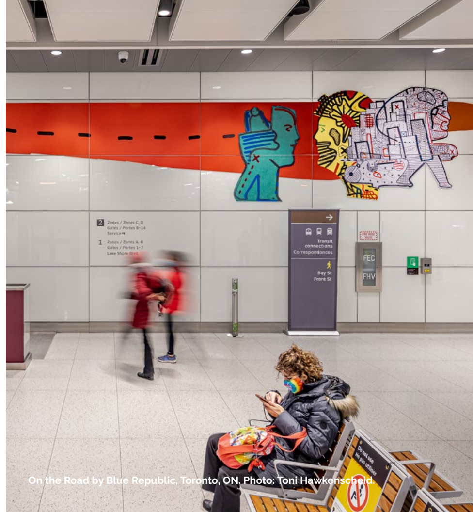
On the Road by Blue Republic, Toronto, ON.