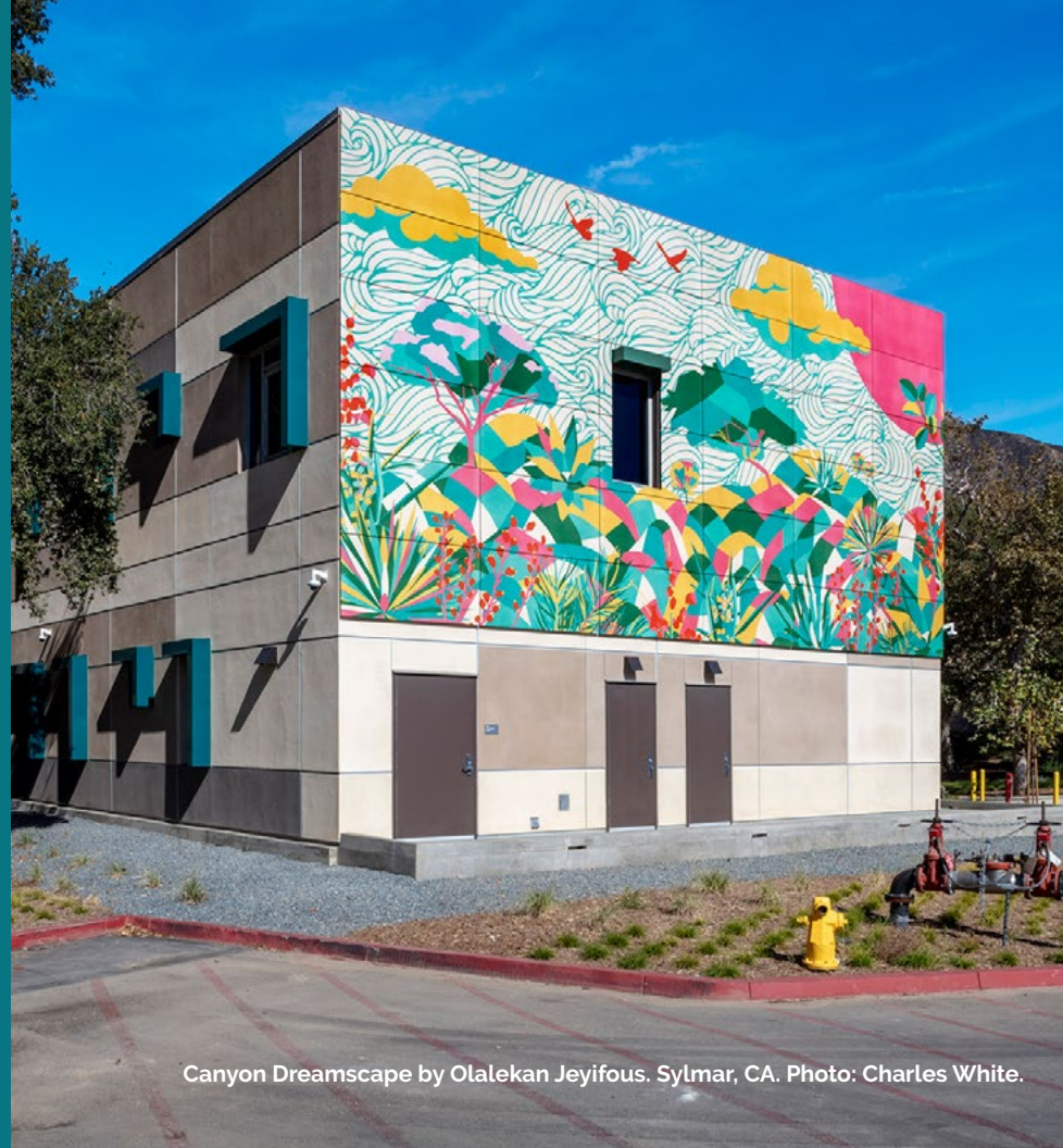
Canyon Dreamscape by Olalekan Jeyifous. Sylmar, CA.